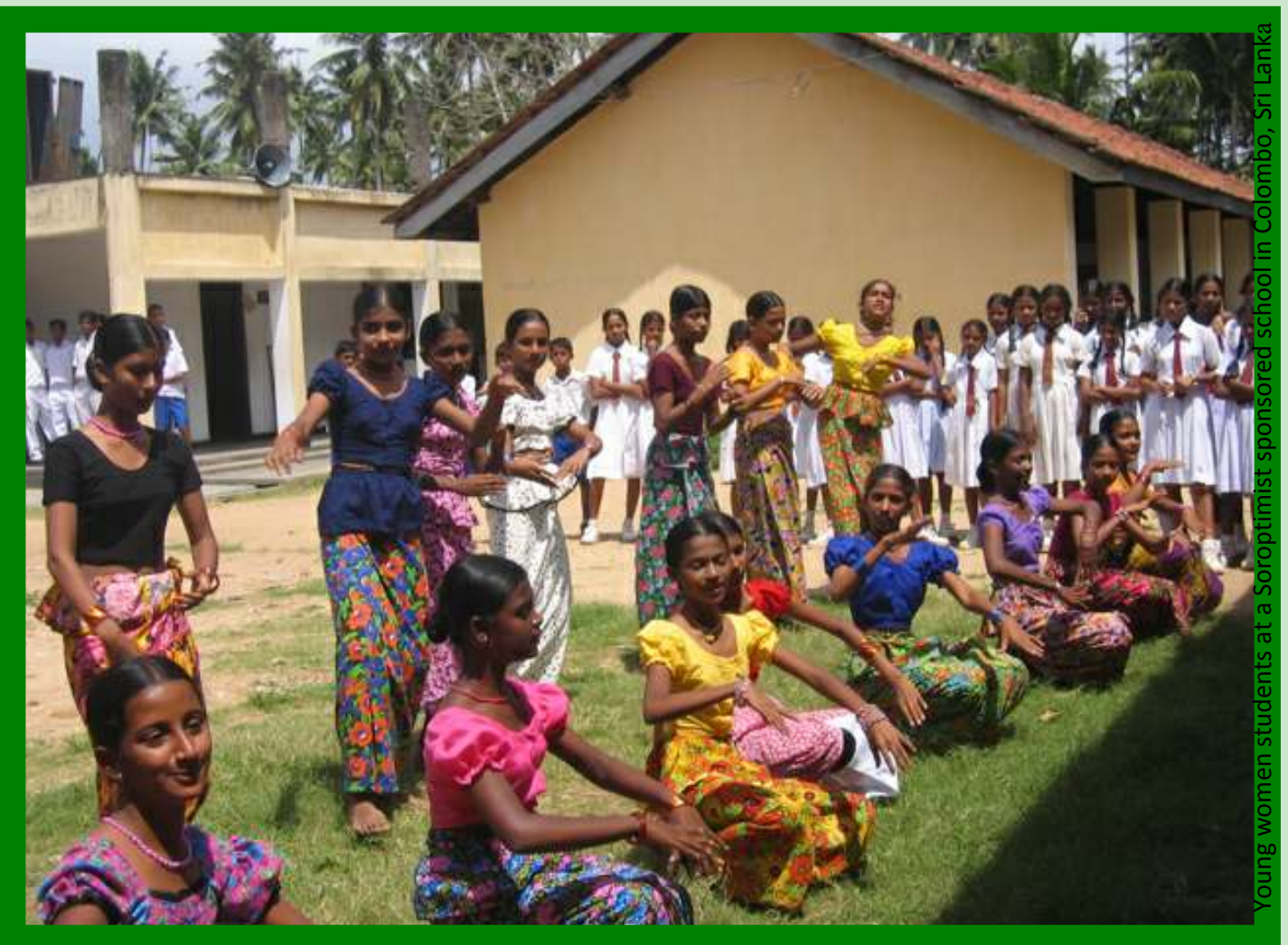
Young women students at a Soroptimist sponsored school in Colombo, Sri Lanka

work and the progress that has been achieved to get us to this point. From this decision this global impact report was born – the first of what will be an annual publication, intended for internal and external audiences alike, to show how Soroptimists are changing the lives of women and girls for the better. We also highlight the most pressing challenges and solutions in accessing education and leadership.