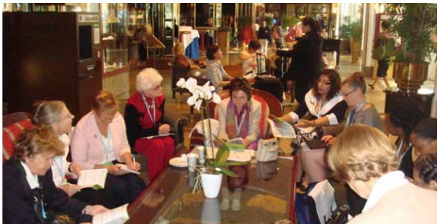
The Soroptimist International team at the UN DPI/NGO Conference in Bonn, September 2011

Since UN DPI/NGO we have taken follow up action to support a joint statement by the