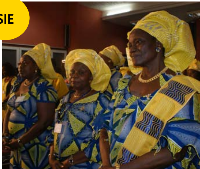
Some 100 Soroptimists from all over Africa attended the 2011 Conference of the Proposed African Federation in Lomé.