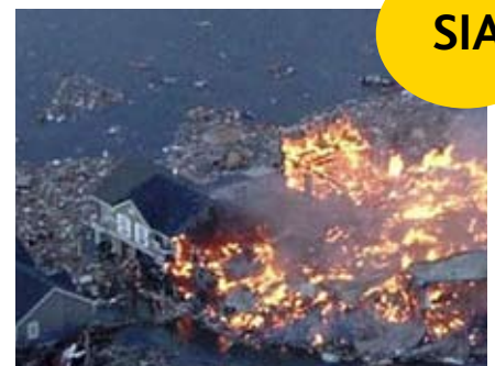
Homes burning after the Japanese earthquake

They have also designed a long-term project, Project Kizuna ("Heart to Heart") to provide scholarships to