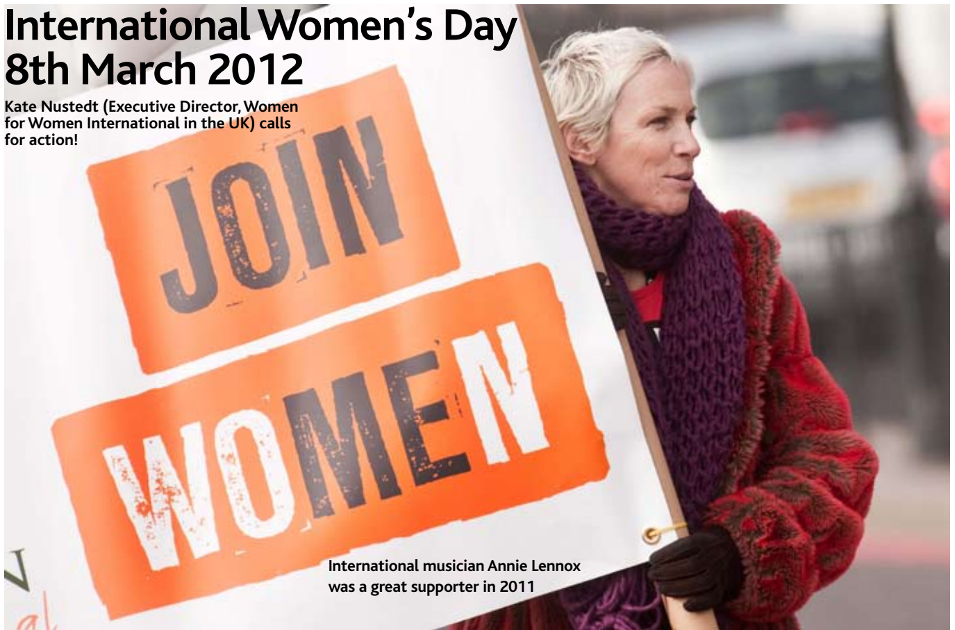
International musician Annie Lennox was a great supporter in 2011