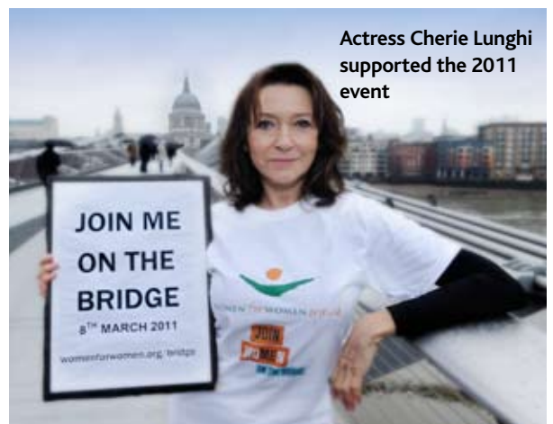
Actress Cherie Lunghi supported the 2011 event

Further information, toolkits and film screenings available at: www.womenforwomen.org/bridge