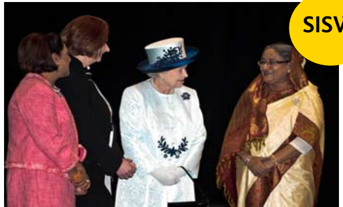
Her Majesty the Queen Elizabeth II with Commonwealth Leaders at CHOGM, Perth Western Australia.

presentation of concerns held by members of Commonwealth Civil Society groups which were treated with consideration by the Foreign Ministers. The full Civil Society Statement, available at http://tinyurl.com/89syp9g – includes the following: