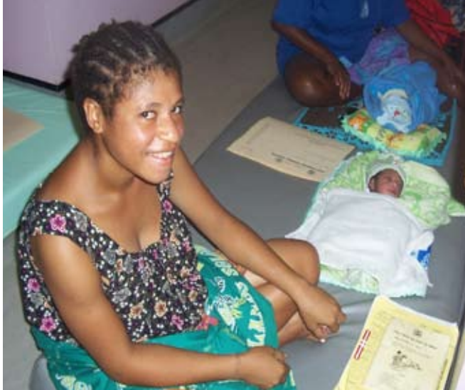
A new baby is ready to go home after a safe birth