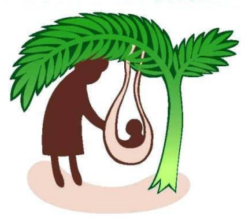
BIRTHING IN THE PACIFIC

Next, for both options, on your marks, get set, GO!