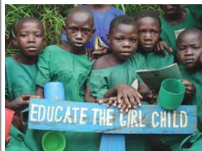
Young girls at Nwamba school in Bugiri, Uganda, promote education for girls.